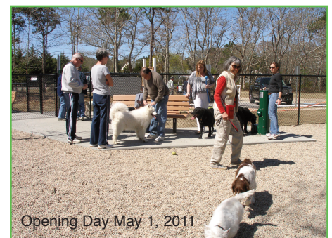
Opening Day May 1, 2011

And please support those that have supported us, listed on the back page.